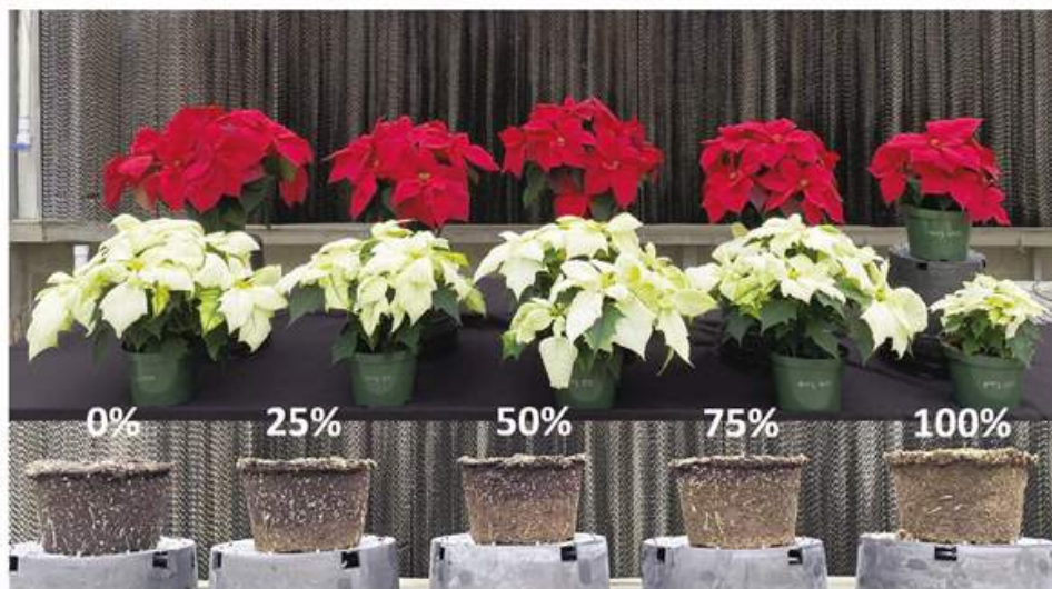
Figure 1. Layering cheaper components like wood under peat may be an effective way to extend peat supplies and cut costs for growers.

Pine tree substrate (hammer-milled pine wood) was layered under peat in 25%, 50% and 75% increments (Figure 1). A control mix of peat:perlite was tested, as was a 100% wood substrate, and all plants were fertigated the same. Results varied by cultivar, but all were successful (comparable to control) with even the