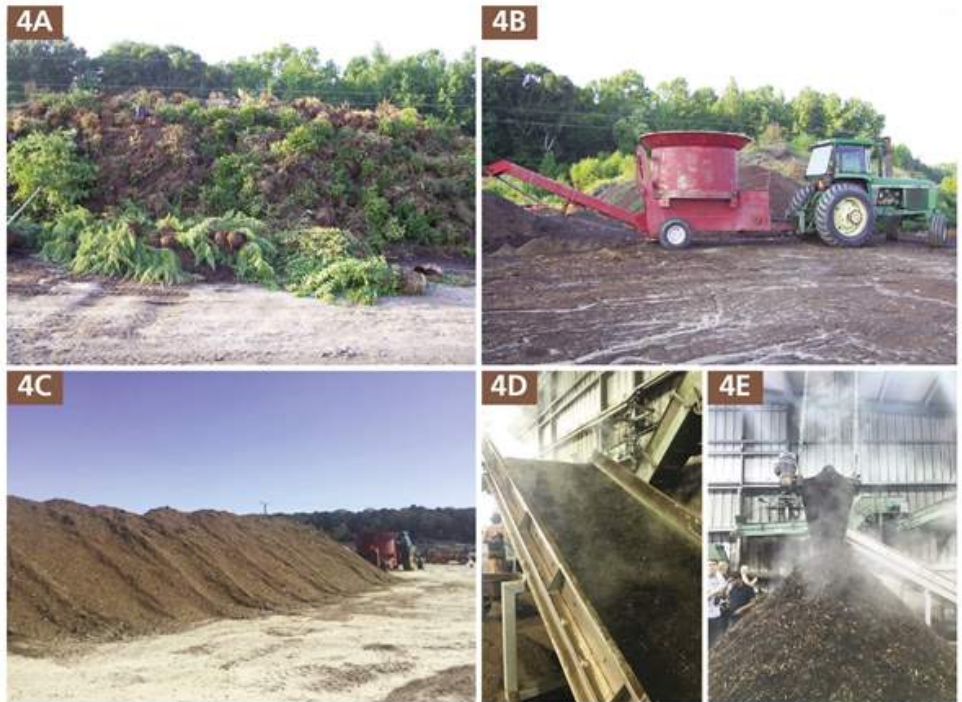
Figure 4. Using recycled/spent substrates or substrates from culled plants has increased in recent years to supplement or stretch peat/coir supplies.

Wood products are, of course, not the only viable option that growers have when sourcing alternative substrates. Numerous other commercial products are on the market for use in loose-fill mixes, including biochar materials, Pittmoss, recycled rockwool, palm core fiber, composts, etc. For propagation and CEA producers, there are also a variety of stabilized media products, Pure Life Carbon and foam technologies (PeatFoam, MooreFoam, GrowFoam, etc.) available. These and other peat-free ▶