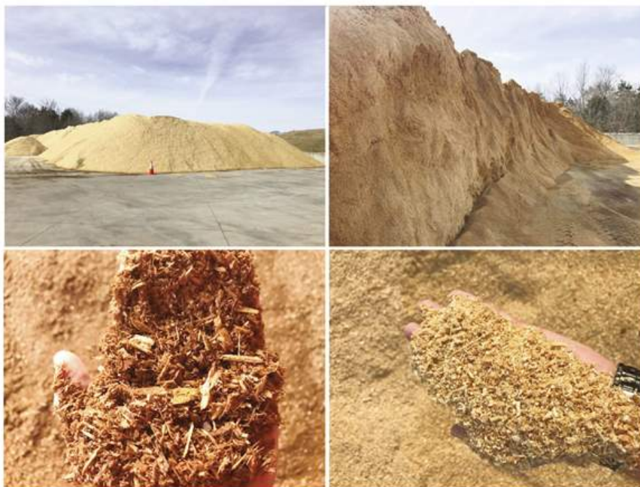
Figure 3. Many growers are acquiring wood shavings, sawdust and other forest residuals from sawmills to use in substrate formulation.

Looking into the future, it's likely that more growers or grower consortiums could decide to produce their own wood substrate materials in this way. I think it's only a matter of time before substrate companies also consider this strategy of wood and bark procurement for use in producing substrates. While most all wood substrates today are made from loblolly pine ( Pinus taeda ), current efforts at NCSU with industry partners around the country are aggressively exploring west coast and northern coniferous species to expand the options and regionality of this renewable resource.