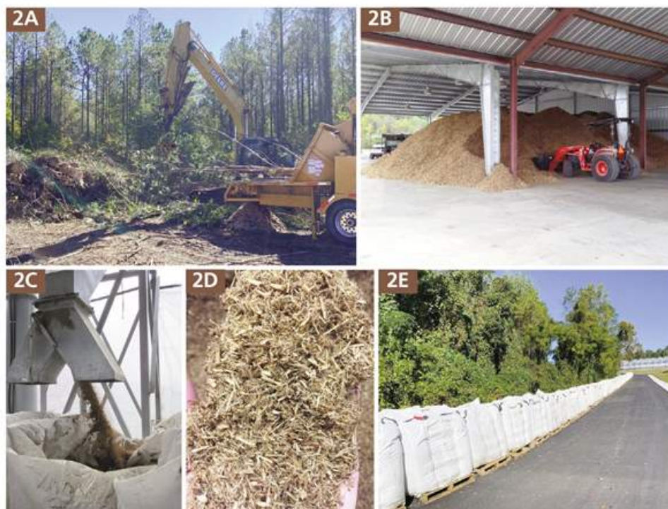
Figure 2. Wood substrate production at grower operations continues to be an economical and successful approach to substrate supply security.

75% wood layer rate producing plants of very high quality. There’s tremendous potential in this approach/practice in the future.