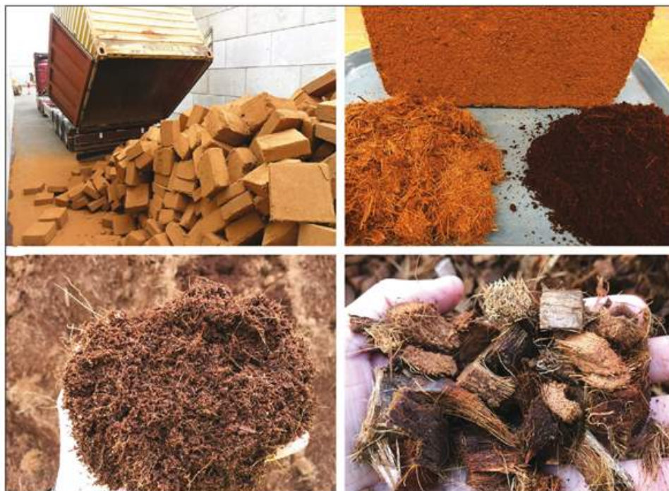
Figure 3. Coconut substrate products are being evaluated for physical and chemical consistencies, and advanced preconditioning methods for product enhancement.

For decades, scientists have studied the bacteria and fungi in soilless substrates by observing the growth or suppression of one organism (beneficial or pathogenic) at a time. Using the NG