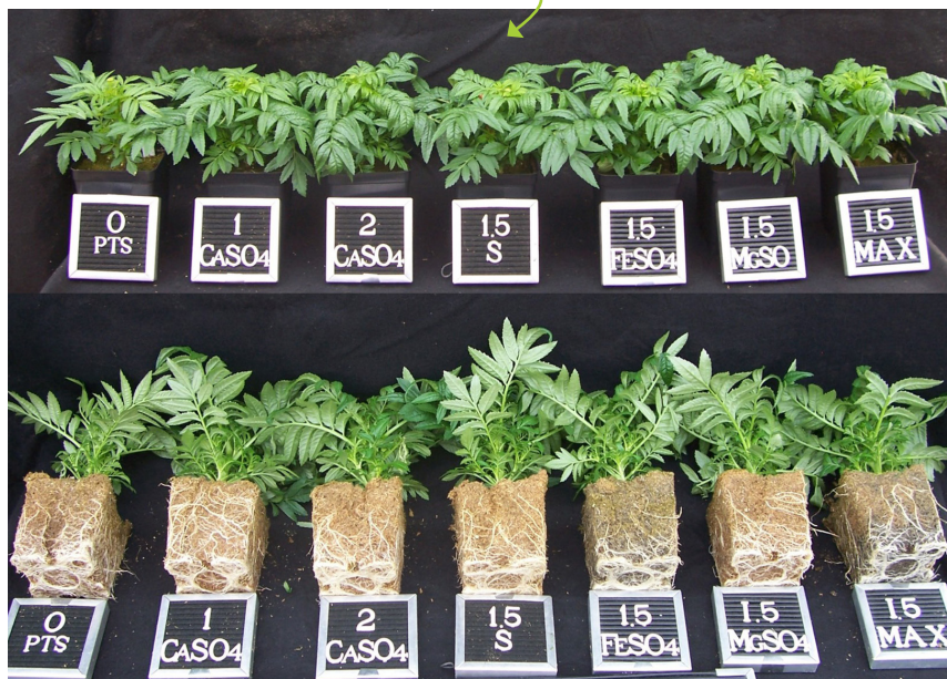
Fig. 4: Marigold shoots (top row) and roots (bottom row) when grown in 100% PTS with different supplements of sulfur

Back in 2004-2005, when the early work was being done on wood substrates, it was initially thought that nitrogen was the only (or at least the main) limiting nutrient affecting