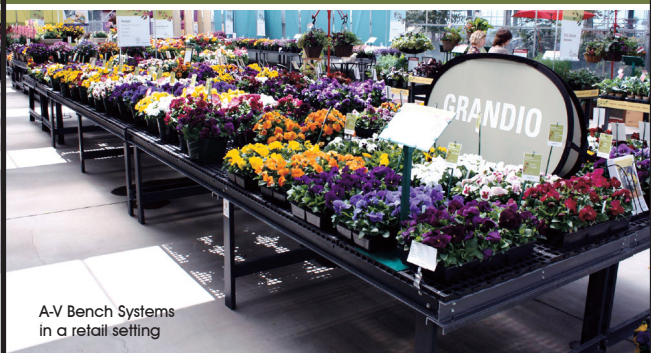
A-V Bench Systems in a retail setting