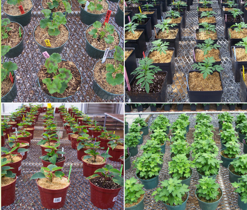
Fig. 2: Multiple species including geranium, marigold, poinsettia and mums have been grown in experimental bark and wood-based substrate trials to document sulfur deficiency and determine sulfur application types and rates.