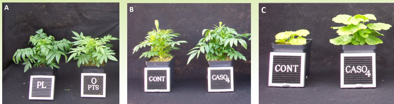
Fig. 5: Marigolds grown in peatlite (PL) with no added sulfur show no deficiency symptoms compared to plants in 100% pine tree substrate (PTS; A). The addition of 1.5 lbs/yd 3 calcium sulfate to 100% PTS (CONT) lessens the deficiency and improves growth of marigold (B) and geranium (C) equal to that of plants grown in peatlite.

and mums to evaluate their response to various sulfur nutrition treatments, sulfur types and amendment rates (Fig. 2). Sulfur deficiencies in wood-based substrates can be exacerbated by the inherently low concentrations of sulfur in pine wood (also bark) and also by the