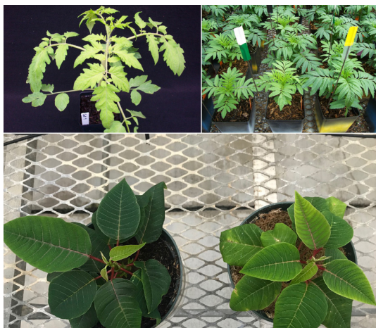
Fig. 1: Sulfur deficiency has been observed in many species grown in bark and wood-based substrates.

Fortunately, there is a decent amount of research trial data on the issues and potential solutions when growing greenhouse crops in high-percentage wood materials. As we and others have written before, the initial research on wood sub-