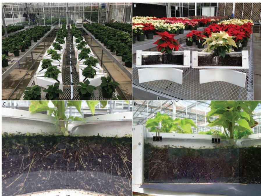
Figure 3. Poinsettia cultivar trials evaluating root growth, flowering performance, and irrigation needs conducted in Mini-Horhizotrons.

wood substrates, more emphasis has been placed on using wood in smaller percentages with peat moss to mitigate the challenges that 100% wood posed.