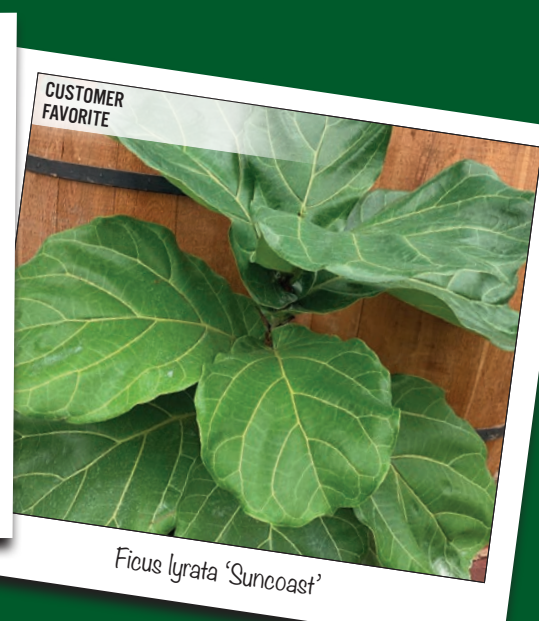
Ficus lyrata 'Suncoast'

BUY AMERICAN | NEW Varieties • 1 Tray Minimum • Custom Grows • 72 Cell Pack Liners