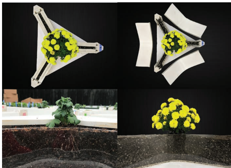
Figure 2. Mini-Horhizotrons have been employed to study the rooting, root growth rate, and overall root development and health of many crops including mums.