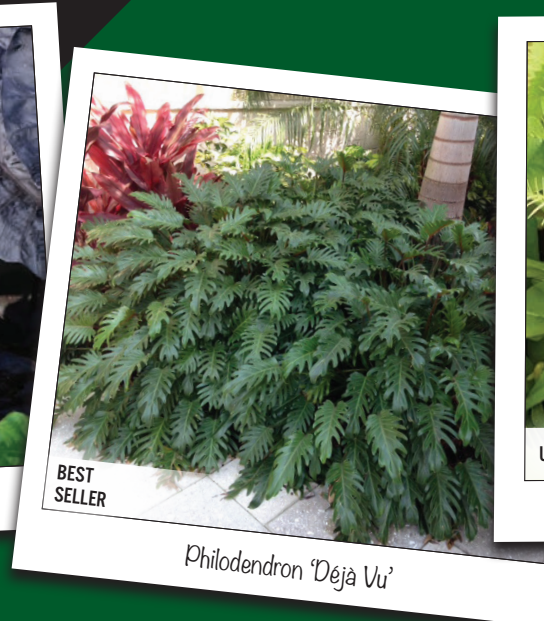
Philodendron 'Déjà Vu'