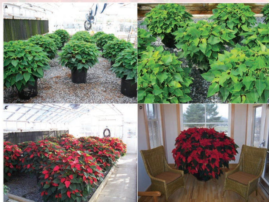
Figure 1. Poinsettias have been one of the most used model crops in wood substrate trials over the past 15 years.

Early fertility trials were also published showing that 100 ppm additional nitrogen was needed for chrysanthemum’s grown in 100% PTS to be comparable to plants grown in a peatlite control. These, as well as many other published works offered a foundation of knowledge about what was needed to be able to successfully grow greenhouse crops in wood substrates. Since these early years of evaluating 100%