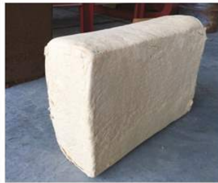
Figure 5. Wood fiber can be baled similar to peat or coconut fiber.