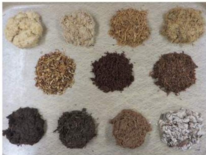
Figure 2. Eleven wood substrate components from North America and Europe.