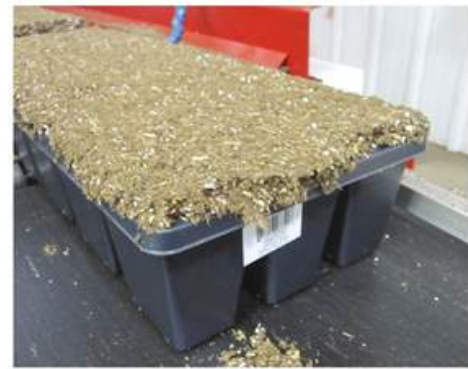
Figure 6. Peat mixes containing wood components in filling machines and small flats.

Understanding these differences and variables is not only important in producing consistent materials, but it's also key in our current understanding of how to actually create very specific wood components that can be used in different ways. For example, if a tree is harvested and processed in chippers, the resulting wood chips can be made into wood aggregates as a perlite alternative/replacement material. These wood chip aggregates have been thoroughly researched and results published highlighting their use as substitute to perlite in greenhouse mixes without any effect/change in physical properties, nitrogen needs, liming adjustments, PGR tie-up or disease susceptibility. These chips can also be colored/dyed if desired.