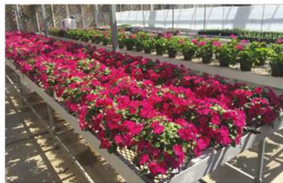
Figure 3. Numerous trials have been growing plants in substrates container wood components for over a decade.