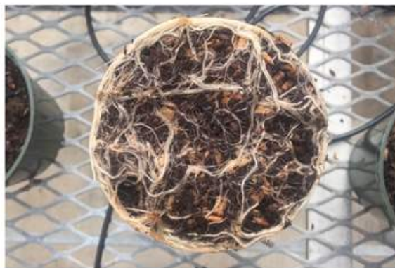
Figure 4. Wood substrates have been shown to enhance root growth of crops.