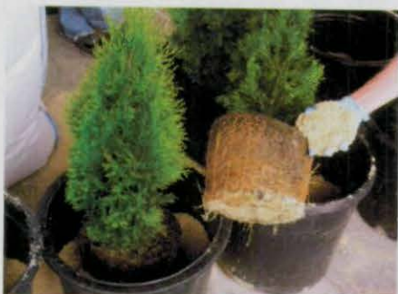
Three-gallon arborvitae were grown from liners in pine tree substrate (PTS), then stepped up to 15-gallon containers and grown for two additional years in PTS.

Previous research showed that hardwood tree species were unsuitable for use