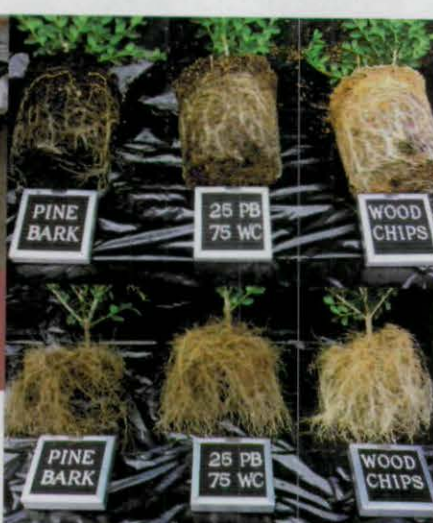
One-gallon Japanese holly — grown for one year in either 100 percent pine bark, 75 percent pine tree substrate (PTS) or 100 percent PTS — all show healthy root systems, often with the most root growth occurring in the wood substrates.

Studies have showed that the output of PTS produced in a hammer mill with no screen in place would be about 76 kilograms per horsepower-hour (kg/hp-hr) compared to only 16 kg/hp-hr for a hammer mill fitted with a three-sixteenth-inch screen. The lower output for producing a smaller-particle PTS would also likely require a more expensive hammer mill designed to move material (coarse pine