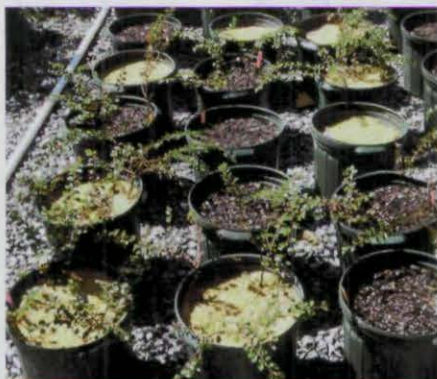
Plants in 5-gallon containers were evaluated for two growing seasons (70 weeks) when grown in pine bark or pine tree substrate under fertilized outdoor nursery conditions to monitor changes in physical properties and substrate shrinkage.

Based on the more current methods of substrate construction (grinding wood to have large particles and amending with other materials for fine particles), it is believed that hardwood species could be viable for use as a substrate component. This is especially true if, for example, hardwood chips are used as 25 percent, 50 percent or even 75 percent replacement/amendment to pine or Douglas fir bark. Some growers in the US have already had success with hardwood substrates. More research with hardwood species is currently underway.