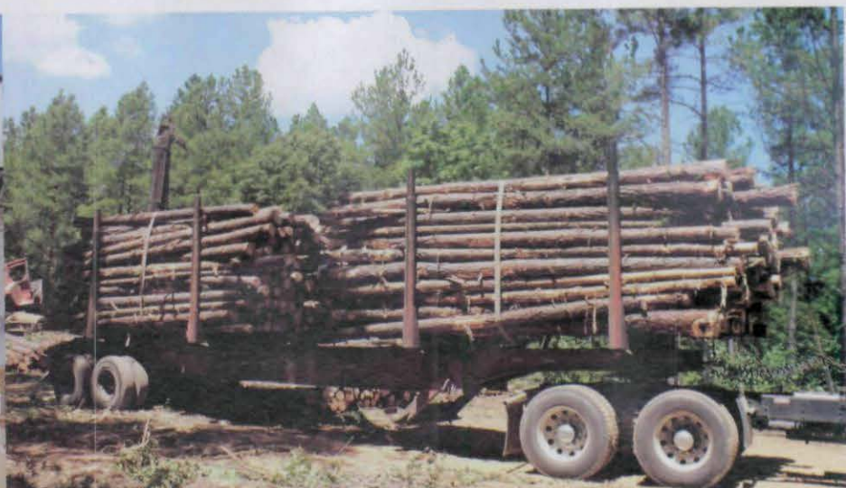
Loblolly pine trees have been harvested and are ready for transport to a processing facility. The pine trees are then chipped and ground in a hammer mill to produce pine tree substrate. The substrate can then be transported, stored or used immediately.

paper production, but pines of any age can be harvested and processed into a substrate. It is even likely that pine plantations could be specifically planted and harvested for substrate production — in other words, nurseries could conceivably grow their own substrate. No composting of PTS is necessary, and the trees can be literally harvested one day and used to pot plants the next day after grinding.