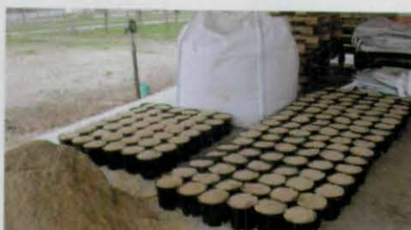
Conceivably, pine trees can be harvested one day then processed into a substrate and potted the next day because no aging or composting of the materials is necessary.

ers was similar for both pine bark and PTS — both around 17 percent. The similarity in shrinkage, despite known higher rates of decomposition in PTS, was due to the increased root volume of the PTS-grown plants, which fills the void left by the decaying wood particles.