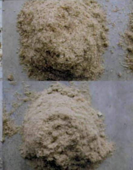
A hammer mill can be fitted with different-sized screens to grind coarse wood chips into any particle size to produce a substrate with physical characteristics similar to pine bark or peat-based mixes.

as a container substrate due to how quickly they decompose and shrink during crop production — a result of the low lignin content in hardwoods. The substrates produced in these studies — conducted in 2006 — were processed with three-sixteenth-inch hammer mill screens to produce small particles that accelerated their decomposition (small particles decompose quickly) in containers and negatively affected plant growth.