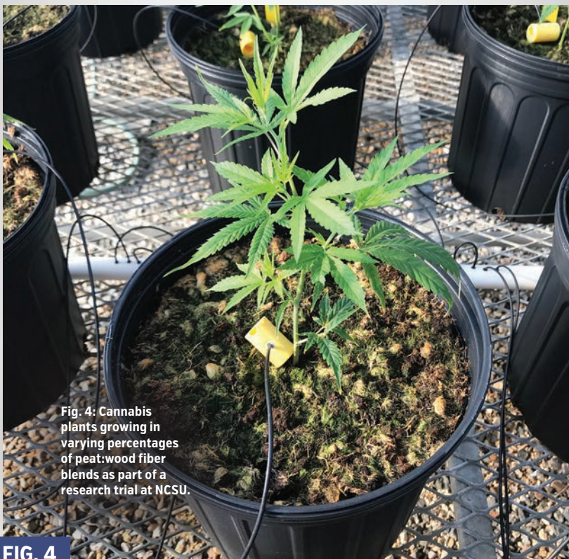
Fig. 4: Cannabis plants growing in varying percentages of peat:wood fiber blends as part of a research trial at NCSU.