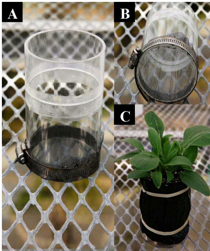
Fig. 2. (A) Design of rhizometer illustrating the clear-sided Plexiglas® allowing for root observations and measurements and the attached collar, (B) the screened bottom, and (C) a complete planted rhizometer with foil attached for light exclusion.

#56, 78 to 101 mm with 1.3-cm band; Burke Brothers Hardware, Raleigh, NC; Fig. 2). The screen on the bottom of the rhizometers allowed for irrigation drainage, held the substrate in the rhizometers, and aided in air pruning of plant roots. The screen was held in place with a detachable metal clamp so it could be replaced with the NCSU porometer base plate to measure the physical properties. Dark-colored pot sleeves (foil) were placed over the rhizometers and held in place with rubber bands to restrict light from the root system.