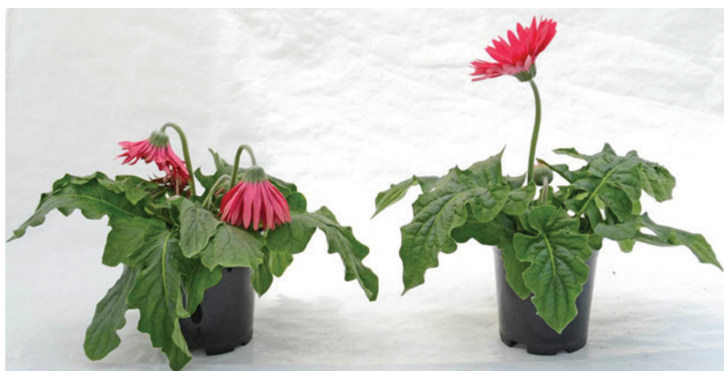
During a dry down test, the gerbera plant on the right stayed turgid, while the plant on the left succumbed to the stress.

Geographic location will largely determine the cost and availability of growing media (peat-based or otherwise), such as coir. Other factors also help determine these costs, including current government rules and regulations, occasional shortages, fluctuations in costs of other components in